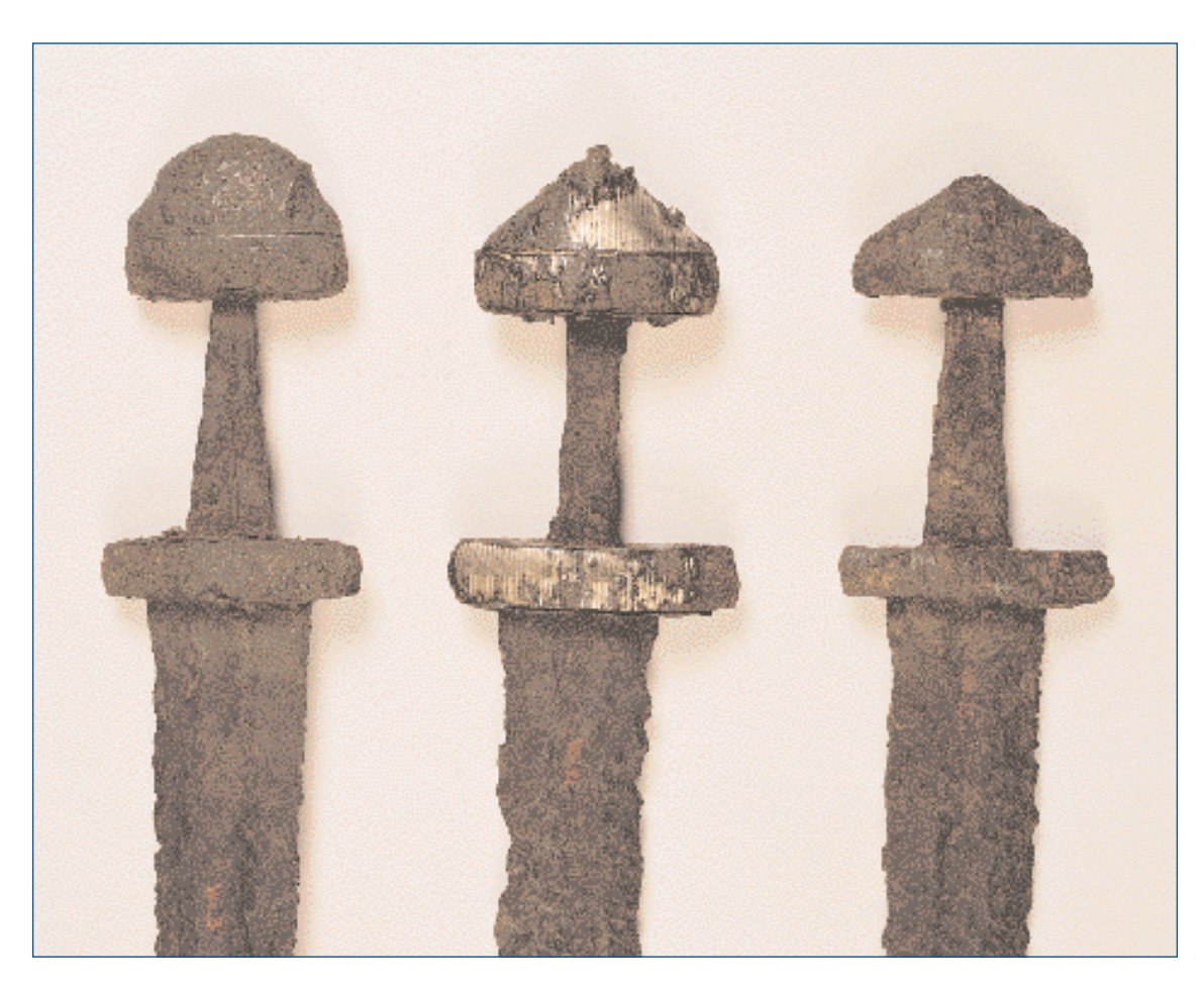
Viking swords from Kilmainham/Islandbridge, Dublin, 9th century AD

Section 26 (2) of the 1930 Act (as amended) provides that, upon application being made to the Minister for Arts, Heritage, Gaeltacht and the Islands and him or her being furnished with such information in relation to the application as he or she may reasonably require, the Minister may, having consulted with the Director of the NMI, issue to any person 'a licence to dig or excavate in or under any specified land for any specified archaeological purpose' (i.e. archaeological excavation licence) and the Minister may insert in any such licence such conditions and restrictions as he or she thinks proper.