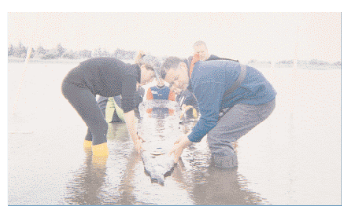
Logboat from the River Shannon at Clonmacnoise

Section 3 (6) of the 1987 Act (as amended) provides that a person finding a wreck over one hundred years old must within four days make a report of the find to the Minister for Arts, Heritage, Gaeltacht and the Islands or the Garda Síochaná. Section 3 (6) of the 1987 Act (as amended) also provides that a person finding an archaeological object which is lying on, in or under the sea bed or on or in land covered by water must within four