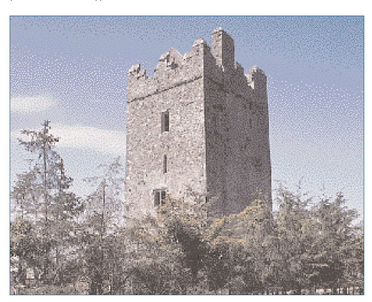
Tower house at Clara, County Kilkenny, 15th century AD, a well preserved example of a common late medieval monument type

'(a) to demolish or remove wholly or in part or to disfigure, deface, alter, or in any manner injure or interfere with any such national monument without or otherwise than in accordance with the consent hereinafter mentioned, or