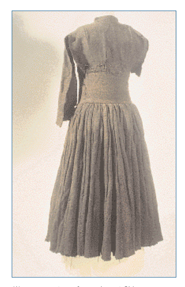
Woman's costume from a bog at Shinrone, County Tipperary, 16th century AD

The Convention provides the basic framework for policy on the protection of the