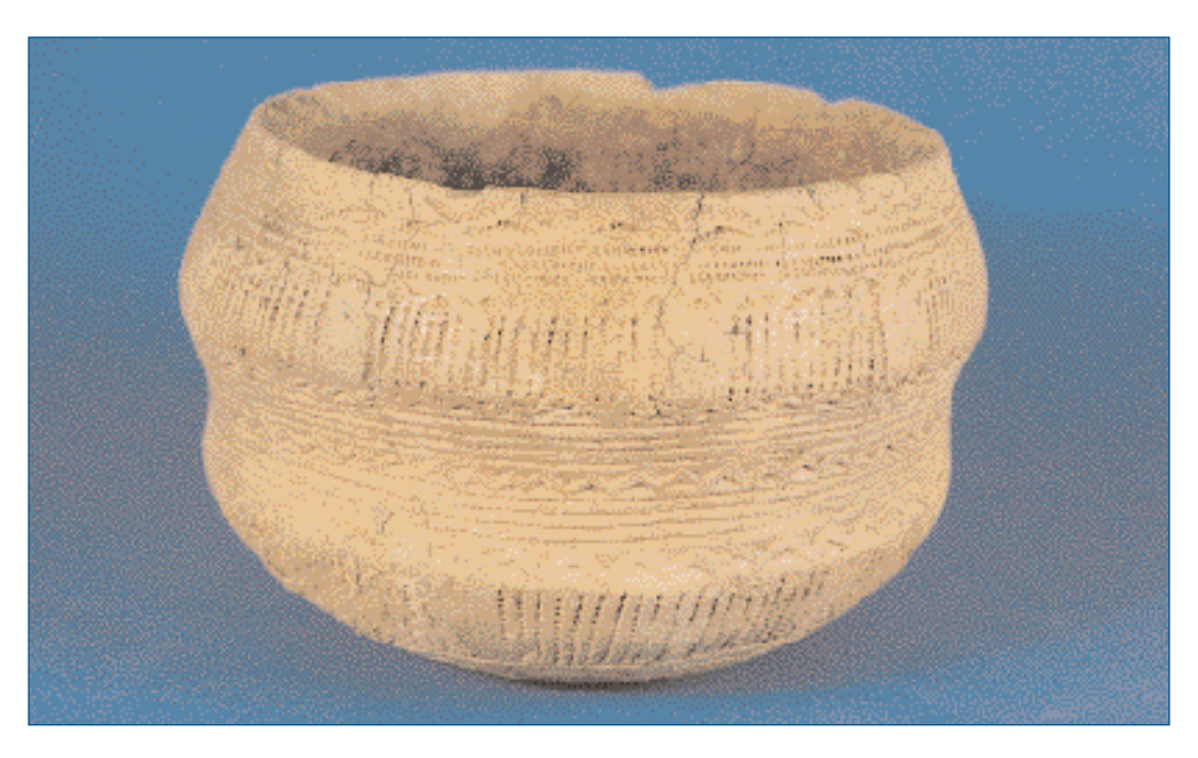
Bowl Food Vessel from a cist burial at Bohullion Upper, County Donegal, a category of Early Bronze Age funerary vessel dating late 3rd millennium BC to early 2nd millennium BC

The provisions of Section 14 of the 1930 Act regarding prohibition of injury to national