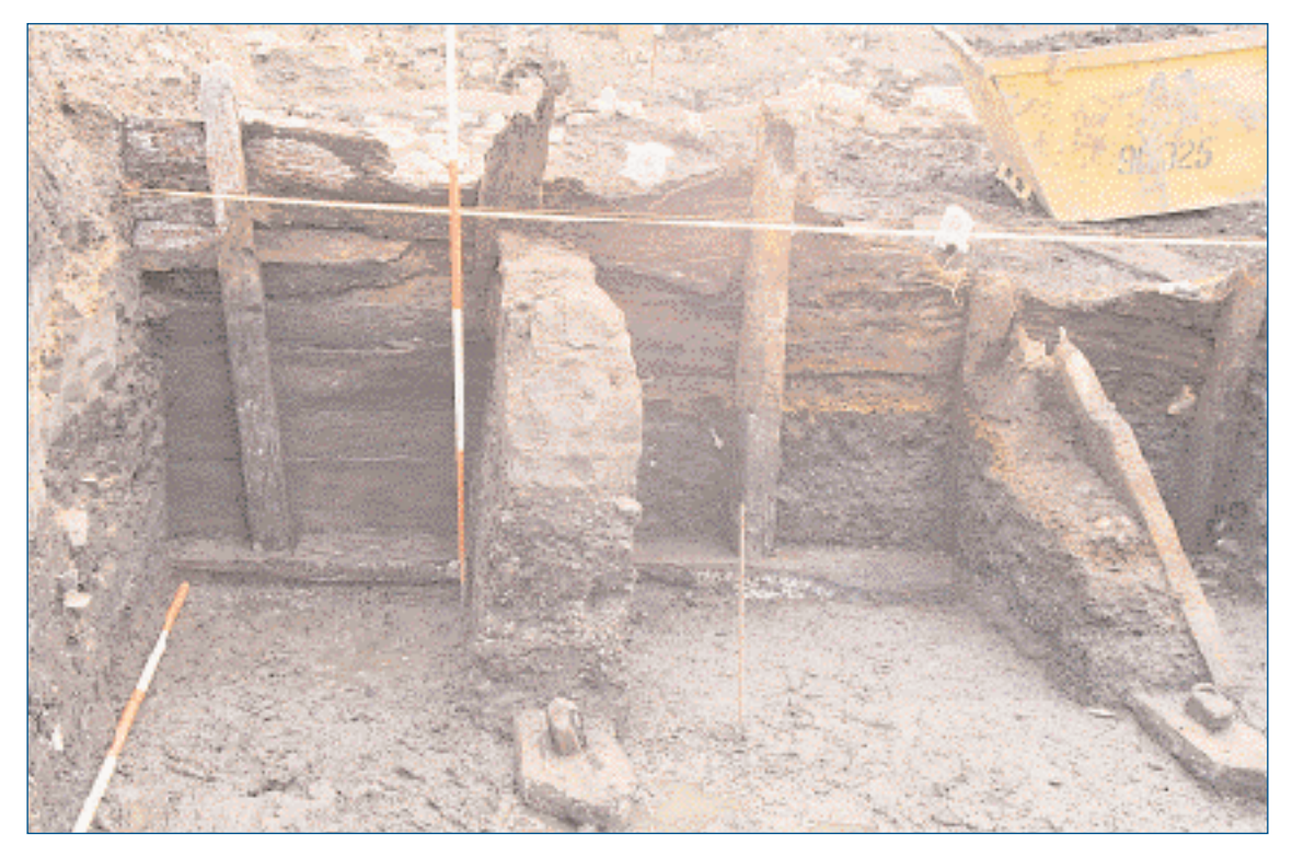
River side revetment, Wood Quay, Dublin dating c.1200 AD, in the course of excavation