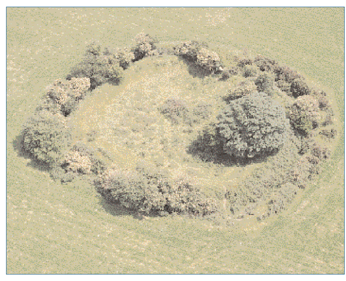
Ringfort at Raheen, County Wicklow, an example of a widespread monument type dating c.500 to 1000 AD

Archaeological assessment may, as appropriate, include documentary research, field-walking, examination of upstanding or visible features or structures, examination of existing or new aerial photographs or satellite or other remote sensing imagery, geophysical survey, topographical assessment, general consideration of the archaeological potential