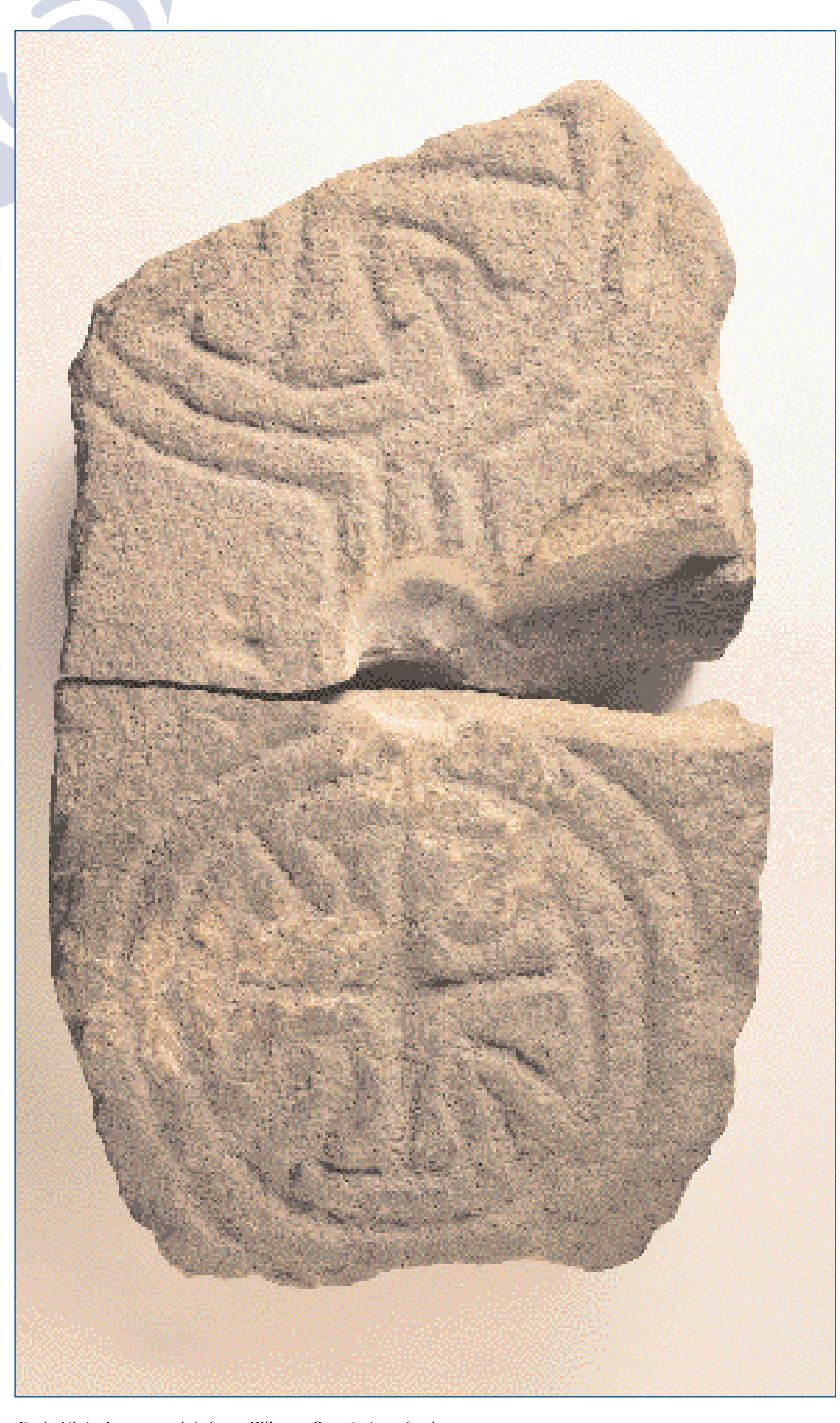
Early Historic cross slab from Killeen, County Longford