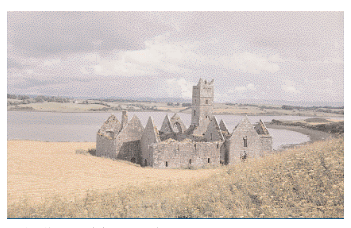
Franciscan friary at Rosserk, County Mayo, 15th century AD

Monuments included in the Record of Monuments under the classification 'historic