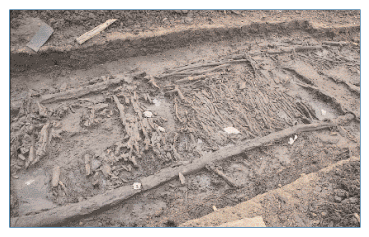
Bog trackway in the course of excavation at Derraghan More, County Longford, dated to the 2nd century BC

Within the framework of government, the Minister for Arts, Heritage, Gaeltacht and the Islands has specific responsibility for the archaeological heritage and exercises functions in that regard under the National