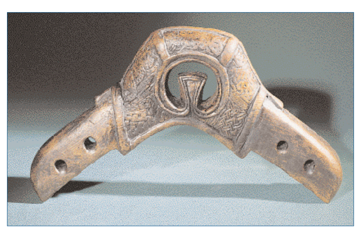
Early Historic saddle bow from a lake at Ballynagarbry, County Westmeath

The National Museum of Ireland (the NMI) is the repository of the national collection of archaeological objects. This collection, now consisting of in excess of two million such objects, has been built up over a century and continues to grow. In addition to this collection the NMI has in its care a large paper archive (including records, reports and other material from the late eighteenth century to the present day) which constitutes the definitive inventory of archaeological objects, and is an essential source for archaeological research and the management of the archaeological heritage.