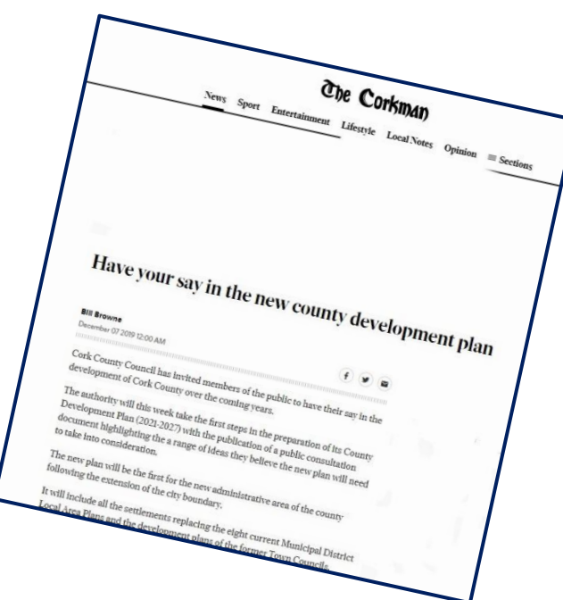
The Corkman Newspaper re Cork Development Plan