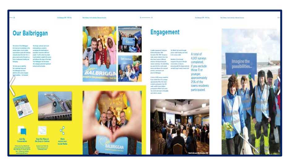
Our Balbriggan 2019 – 2025 Rejuvenation Plan